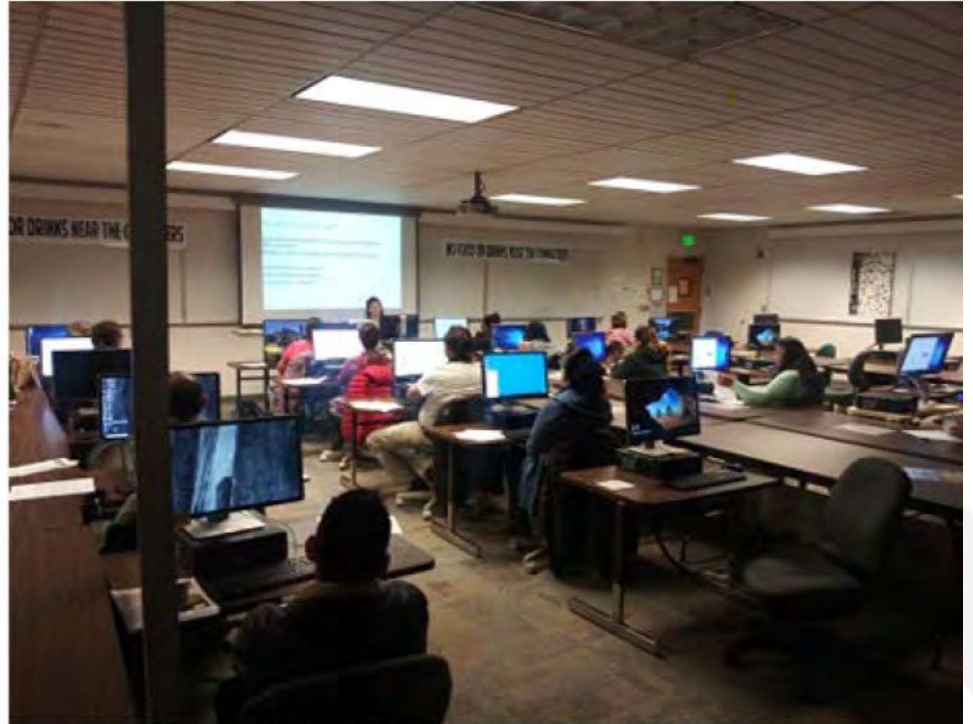
Free website-building platform Wix workshop held at Skagit Valley College.

Northwest Agriculture Business Center funded technical assistance for Latino Farmers for computer classes and assistance with website development