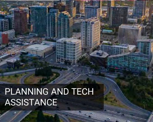
PLANNING AND TECH ASSISTANCE