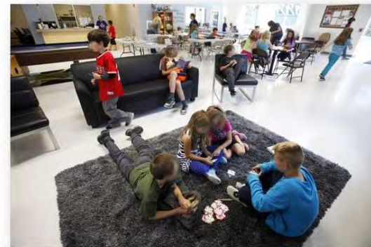
Sultan Boys & Girls Club