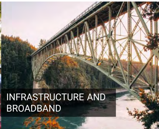
INFRASTRUCTURE AND BROADBAND