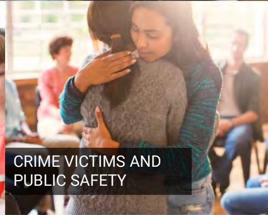
CRIME VICTIMS AND PUBLIC SAFETY