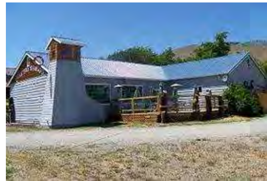
Entiat Valley Community Services