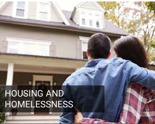
HOUSING AND HOMELESSNESS