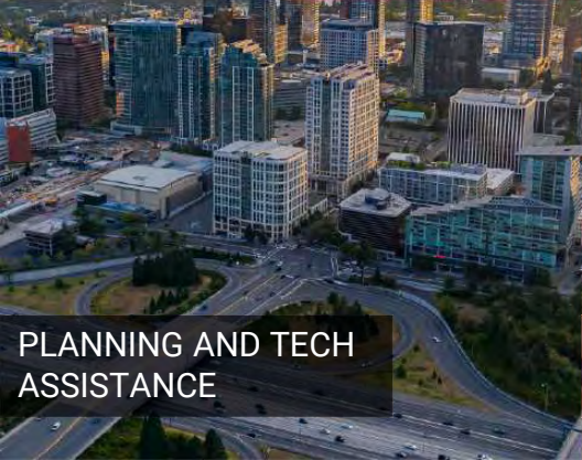
PLANNING AND TECH ASSISTANCE