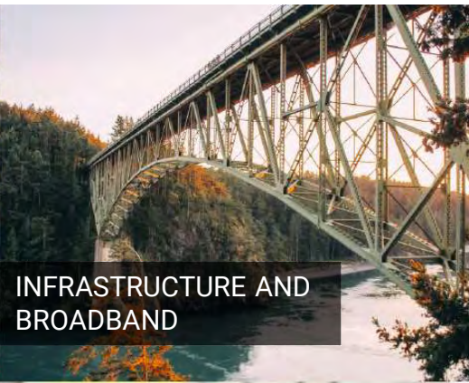
INFRASTRUCTURE AND BROADBAND