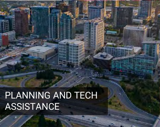
PLANNING AND TECH ASSISTANCE