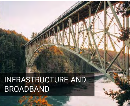
INFRASTRUCTURE AND BROADBAND