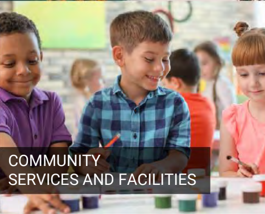
COMMUNITY SERVICES AND FACILITIES