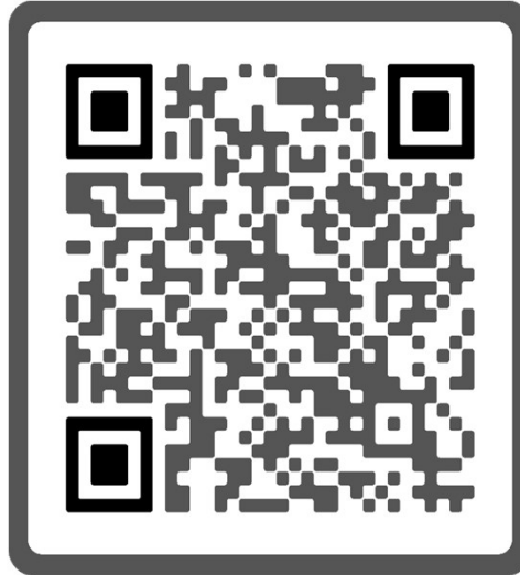
Federal Funds Grant Writing Assistance Program