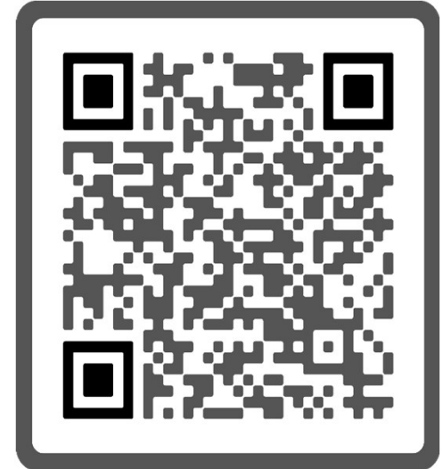
Federal Clean Energy Tax Credit Assistance Program